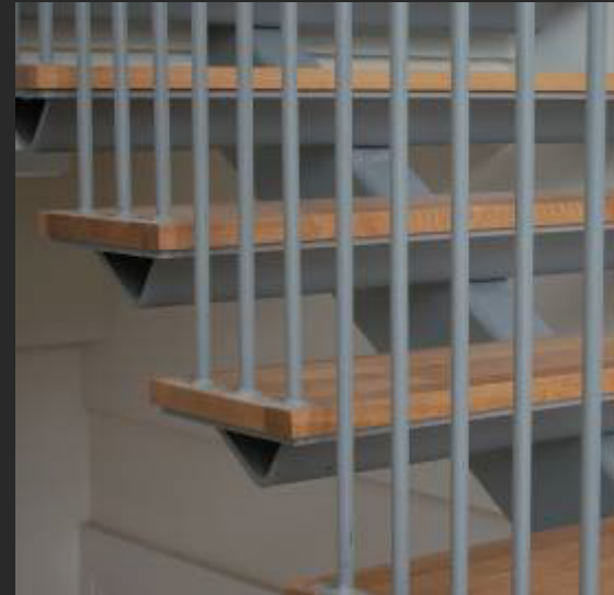
Work is ongoing at 80 – 84 O'Connell St. No.'s 80 and 81 have been completed with work to the remainder of the former County Council Offices due for completion in Spring 2009. The project involved the restoration and refurbishment of the existing Georgian buildings with their historical subdivision being reinstated and a new pristine glass roof extension to replace the double pitch roof which had been replaced in the 1970's with a flat roof.