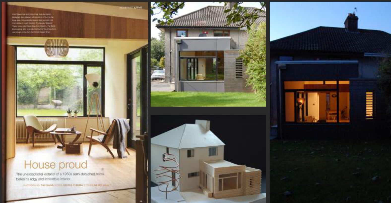
Our project 14 Ashbourne Park was published in both Image Interiors (Nov-Dec Issue) and in Plan Magazine ( Small Projects Issue).

The practice has been involved in and completed a number of interesting projects of various scales during 2008. Though unsuccessful we completed our submission for the Henrietta St. Competition which we were very satisfied with in terms of response to the brief and the making of a new insertion into the existing Georgian fabric. We have also continued our research in certain fields such as the urban progression of the city of Limerick and the examination of the optimum wall construction with respect to energy efficiency, cost and carbon footprint.