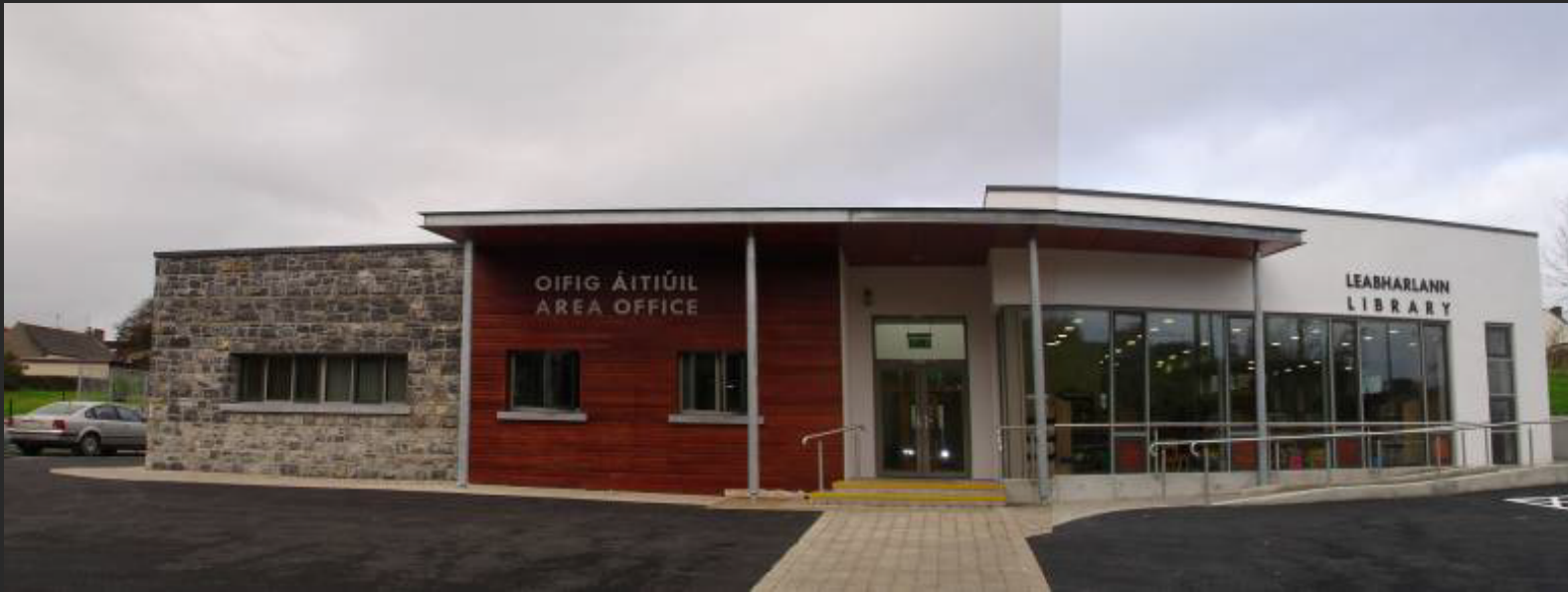
Scariff Library and Area Offices for Clare County Council opened in early 2008.